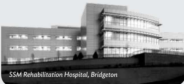
SSM Rehabilitation Hospital, Bridgeton

Our partners also benefited from how we gave back in 2012. At the start of each joint venture, we go to great lengths to articulate our commitment to a collaborative partnership. We tell them together we can be stronger, and we mean it! Our approach to partnership pays off with investments and enhancements in the communities we serve. For example, in January 2012 the joint venture between Select Medical and SSM Health Care in St. Louis (established in December 2009) opened a newly constructed, state-of-the-science 60-bed SSM Rehabilitation Hospital in Bridgeton, Missouri.